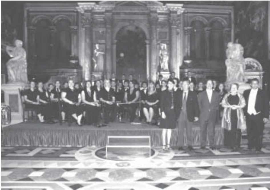
Above: Salone Scuola Grande di San Rocco in Venice; below right, the Colosseum in Rome.